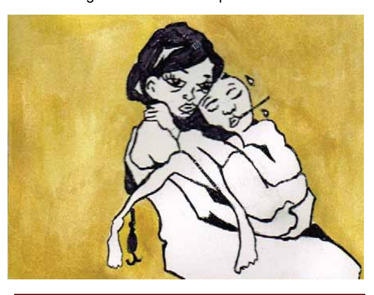
Some clinics, hospitals and doctors' offices have stopped offering services to people covered by IFH, while others are asking patients to pay upfront.

A medical centre in Ottawa posted a sign in its window to say that it no longer accepts IFH coverage. The clinic director explained that dealing with IFH is too much trouble. It is not readily apparent from a patient's IFH certificate what services are covered. Some bills previously submitted for refugees were not reimbursed. It is